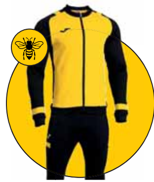
Match Day Tracksuit