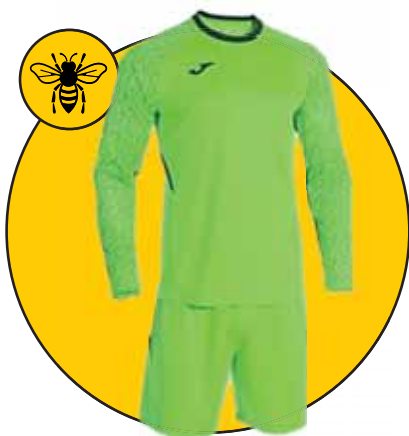
Goalkeeper Kit Shirt & Shorts