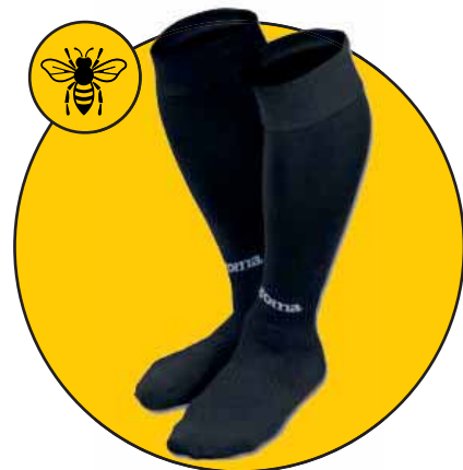
Home Kit Socks