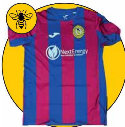
Away Kit Shirt