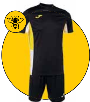
Training Kit Shirt & Shorts