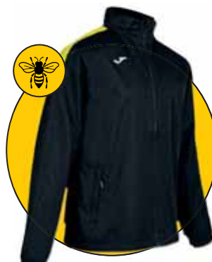
Training Kit Jacket