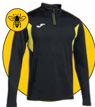
Training Kit 3/4 Zip Top