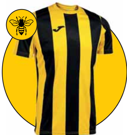
Home Kit Shirt