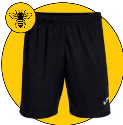
Home Kit Shorts