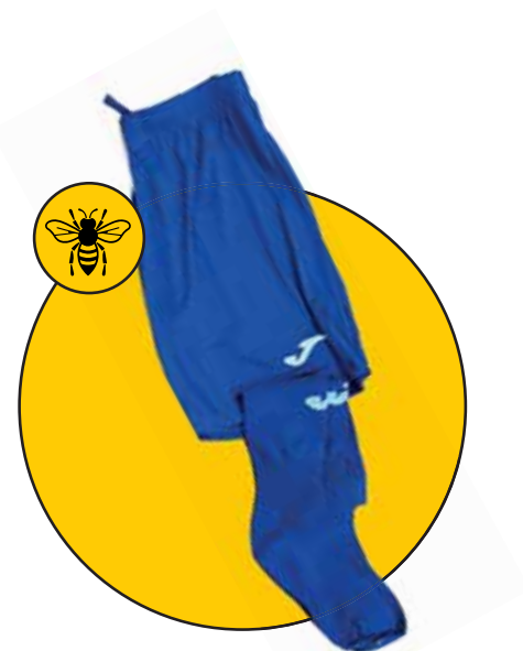
Away Kit Shorts & Socks